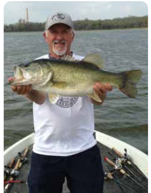
Reservoirs at Sooner Power Plant and at Seminole Power Plant's Lake Konawa are periodically stocked with game fish by the Oklahoma Department of Wildlife Conservation.

In 1971, OG&E became the first electric company in Oklahoma to open one of its cooling reservoirs for public recreation. Today, Oklahomans and outdoor enthusiasts from around the country enjoy boating, fishing and swimming at Seminole Power Plant's 1,350-acre Lake Konawa and Sooner Power Plant's 5,400-acre reservoir. Both reservoirs are periodically stocked with game fish by the Oklahoma Department of Wildlife Conservation and as a result, contribute to Oklahoma's travel and tourism industry.